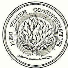
Seal of the Scotch Kirk.